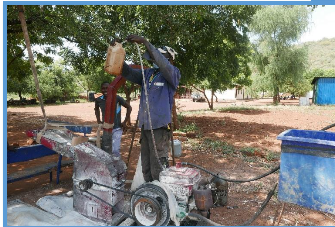
Figure 8 The grinding mill transferred to VTC.

The grinding mill from Kuron Village has been moved to the VTC to service the students in Secondary and VTC as well as the nutritional program at the Health Centre. This saves time and money.