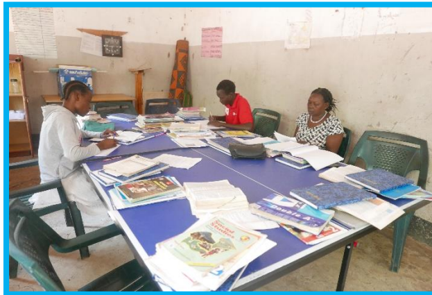
Figure 5 Primary Teachers preparing exams and lessons

Exams will be administered early December. Teachers are busy copying and collating the tests. Debates finished with P8 the eventual over-all winners. The Spiritual Counseling sessions have continued throughout the month.