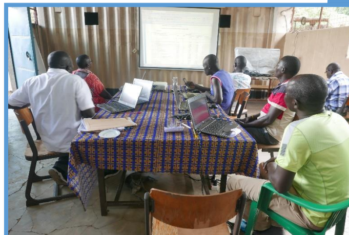
Figure 3 Senior Staff plan programs and budgets for 2022 together.

On Nov.06.2021, an all Staff Budgeting and Planning meeting was held. This was an excellent opportunity to learn how to formulate and write budgets and how to plan for future activities. It was also good to have all the staff provide input and see what other departments are planning for 2022.