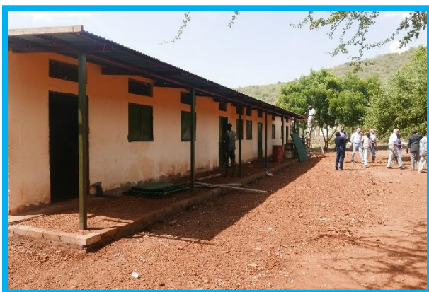
Figure 6 New expansion of dormitory on the north side of VTC building

The awning for shade/rain protection around the VTC building as well as expansion has been coming along well.