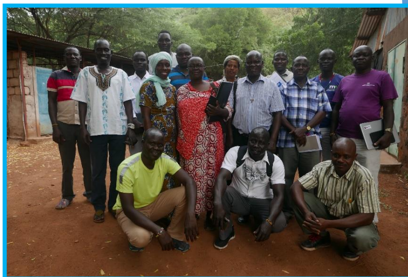
Figure 1 Dept. Heads and Senior Staff of HTPVK